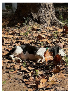
Taking a Well-Deserved Nap