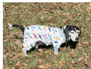
Dressed Up in His PJ's for the Day!