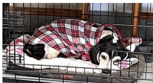
Taking It Easy in the Early Days