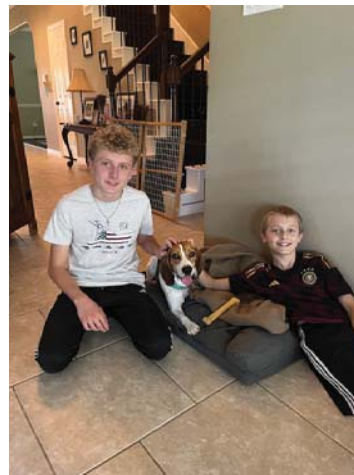
Boomer with his new pack!